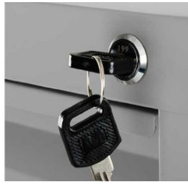
Good lock with master key