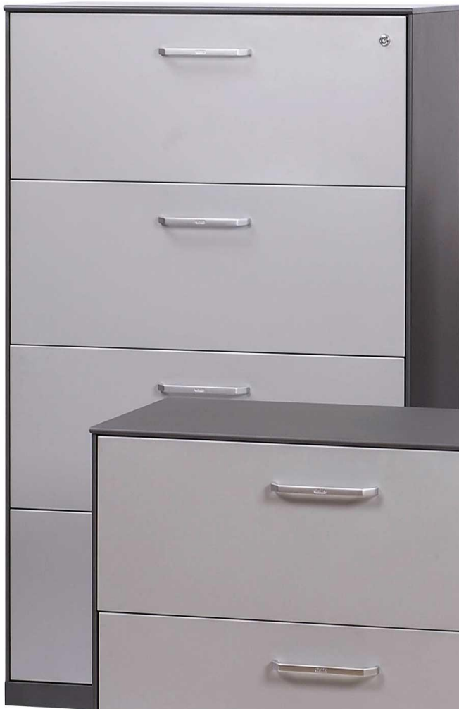
LD-C2 2 Drawer